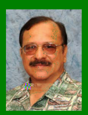
Zika Virus Research